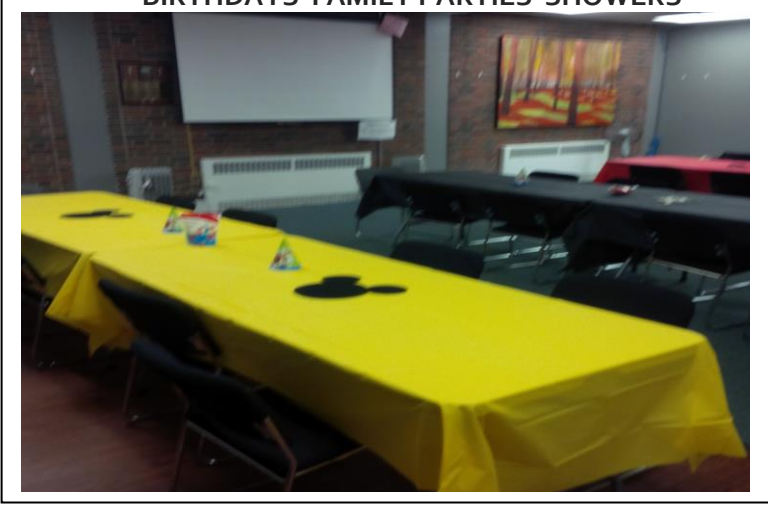
BIRTHDAYS FAMILY PARTIES SHOWERS

Need a place for a shower, sacrament or family gathering on the weekend? Check us Out!