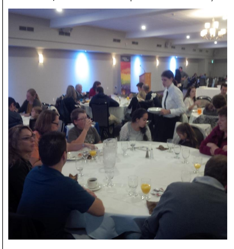
You deserve a break for World Teachers Day with Breakfast!

So far over 70 have reserved a spot at Breakfast this year!